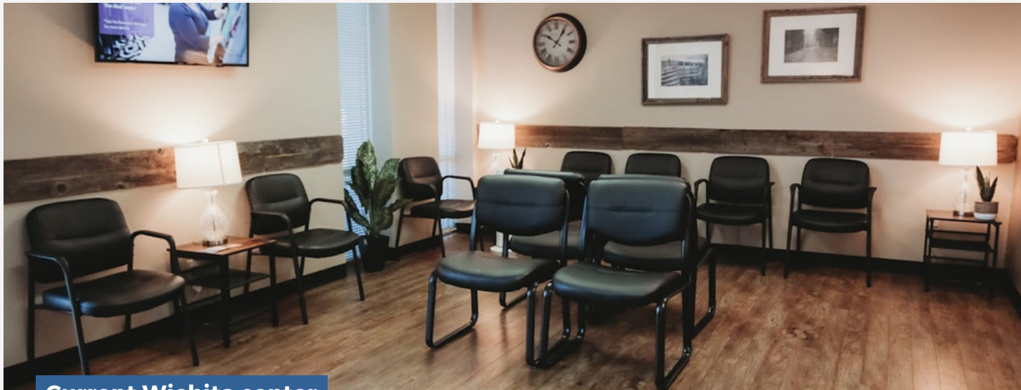
Current Wichita center